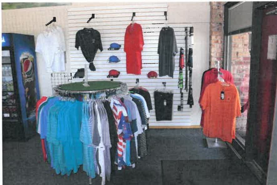
Bobby Jones Golf Course Pro Shop Merchandise

See the table on the following page for ratings of the seven audit objectives by individual department: