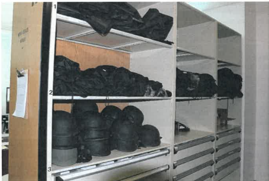
SPD Equipment Storage