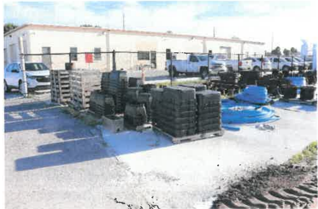
Utilities Outside Inventory Items