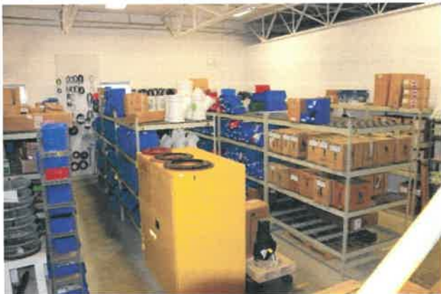
Utilities Primary Equipment Storage

Each observation and corresponding recommendation is further addressed on pages 10-11.