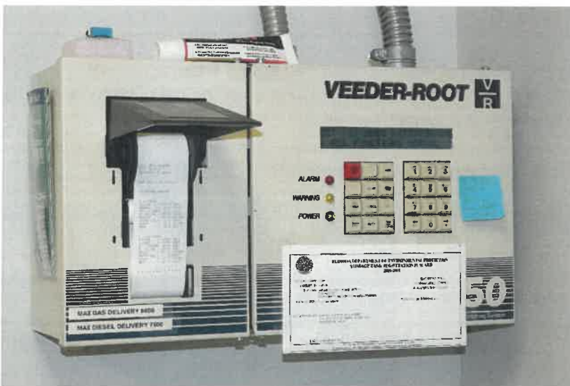
Public Works Fuel Veeder-Root Fuel Monitor