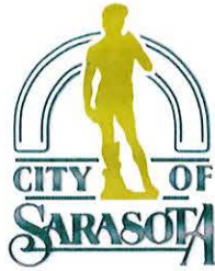
Exhibit "A" to Ordinance No. 18-5264